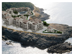
White Diamond Luxury Resort, Carevo