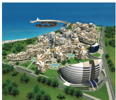
Costa del Croco, Carevo