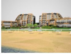
Crotiria Beach Complex, Pomorie